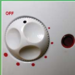
Easy Intuitive Controls