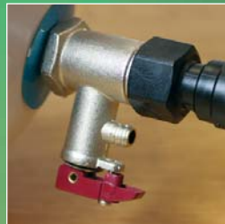
Multiple Safety Devices